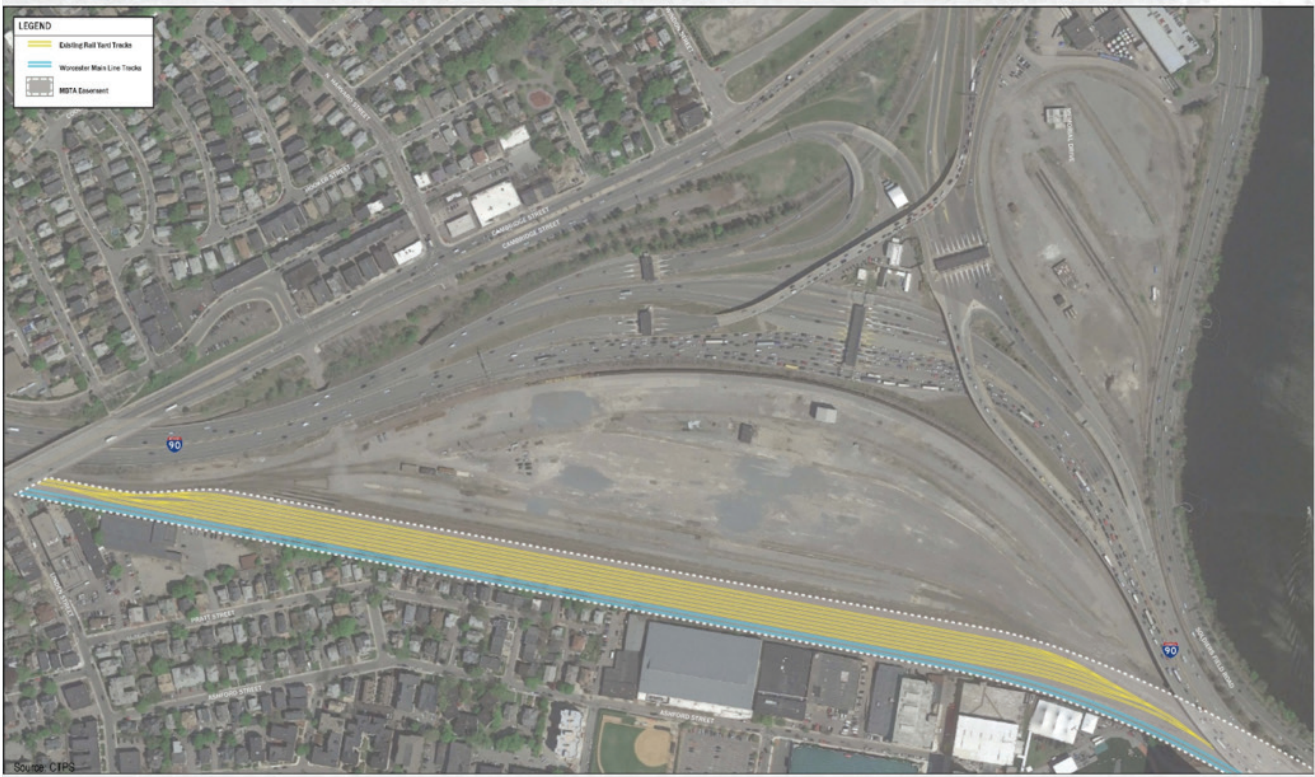
Figure 1: The Allston Multimodal Project area before (top) and after (bottom) the proposed upgrades under the SFR Hybrid Option 20