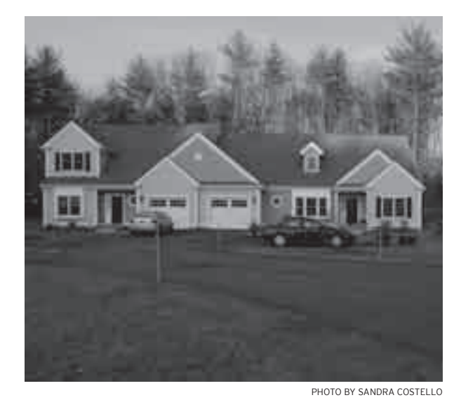
Age-restricted attached units in Rowley

into the restricted units, they often free up unrestricted housing for families. Nonetheless, while there is clearly market demand for the denser housing, the 55+ requirements are largely driven by municipal policy, not market demand for deed restrictions on occupancy.