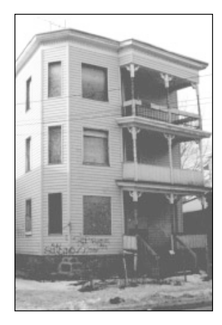
Could the Third Party Transfer program be replicated to reclaim abandoned property in Massachusetts urban areas?

Once the transfer structure and strategy have been developed, the municipality must obtain the legislative authority to initiate in rem foreclosures and complete third party transfers. Many municipalities already have the ability to initiate foreclosures, and auction or assign tax liens. Those cities can modify that legal mechanism or adapt other legal authority to create a third party transfer process. New York City's Local Law 37 of 1996 can serve as a model on which to develop the legislation.