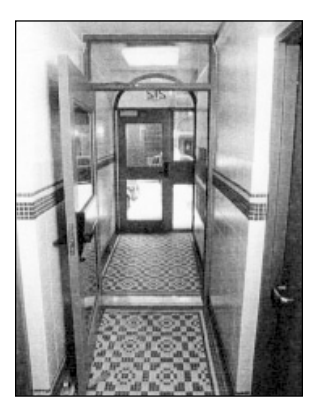
The entrance to 212 West 140th Street in New York City prior to rehabilitation by the City (left)—17 years after the building was acquired by foreclosure—and a year later (right) after renovations were finally completed.

During the 18 years of City ownership the City lost approximately $160,000 in tax revenue. Based on program per-unit maintenance and utility cost averages, the City spent approximately $1.3 million maintaining this building. In sum, between maintenance, foregone tax revenue, and rehabilitation costs, the City spent approximately $2.8 million to restore the building to the private sector working class housing it was years earlier.